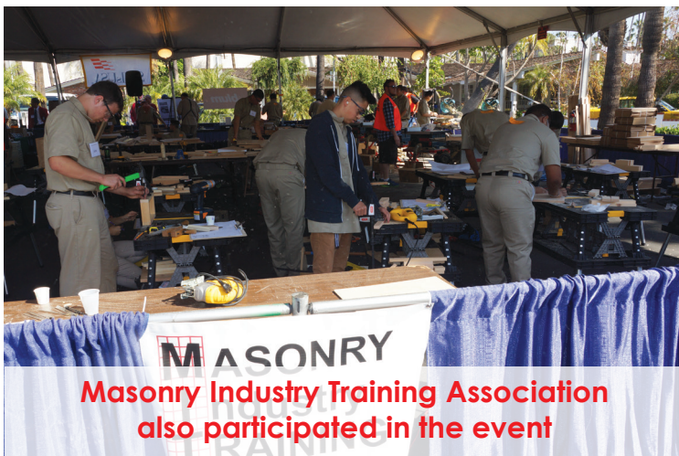
Masonry Industry Training Association also participated in the event